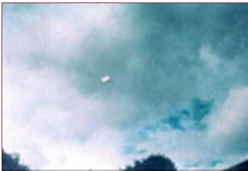
UFO sighting over Chilca, Peru 1975

Nonetheless, let me start from the beginning: