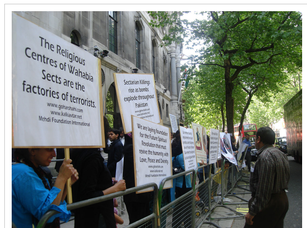
Protestors occupying the street outside the Indian Embassy, London

Messiah/Mehdi Foundation International has centres in Canada, the United States of America, the United Kingdom, Australia, India, Greece, Thailand, Taiwan, South Korea, Nepal, Japan, Bangladesh, and Pakistan. In association with their sister organisation, Kalki Avatar Foundation, the organisation has centres located in Sri Lanka and India. Representatives of MFI often visit spiritualist expositions and programs. They also hold events.