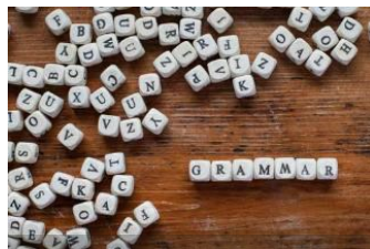
Easy Learning English Grammar