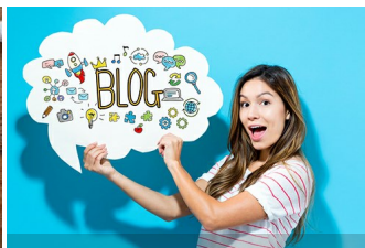
Word Lover's Blog