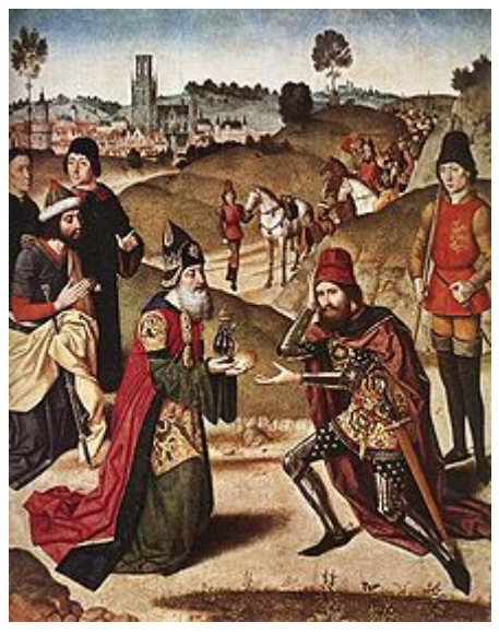
Meeting of Abraham and Melchizedek, canvas by Dieric Bouts the Elder, c. 1464–1467