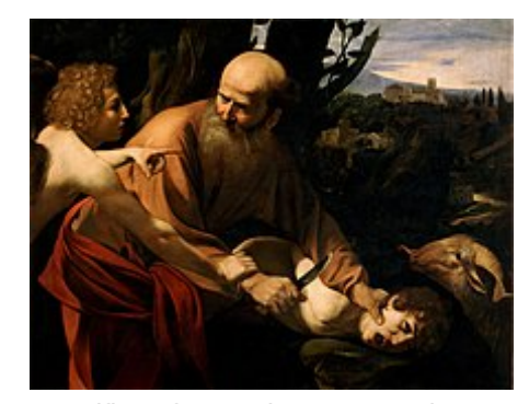
Sacrifice of Isaac, by Caravaggio, c. 1603 (Uffizi, Florence)

tears. After God heard the boy's voice, an <u>angel of the Lord</u> confirmed to Hagar that he would become a great nation, and will be "living on his sword". A well of water then appeared so that it saved their lives. As the boy grew, he became a skilled <u>archer</u> living in the wilderness of <u>Paran</u>. Eventually his mother found a wife for Ishmael from her home country, the land of Egypt. [Genesis 21:14–21]