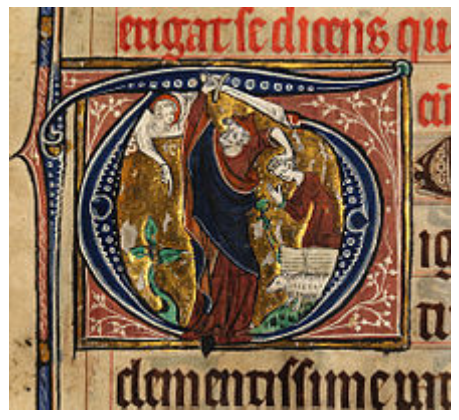
Abraham about to sacrifice Isaac, from an East Anglian missal, <u>c.</u> 1315 (National Library of Wales, Aberystwyth)

Early the next morning, Abraham brought Hagar and Ishmael out together. He gave her bread and water and sent them away. The two wandered in the wilderness of <u>Beersheba</u> until her bottle of water was completely consumed. In a moment of despair, she burst into