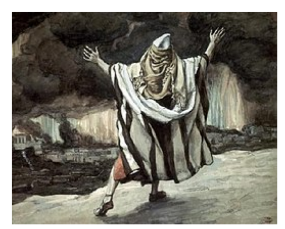
Abraham Sees Sodom in Flames, watercolor by James Tissot, <u>c.</u> 1896–1902

After eating, Abraham and the three visitors got up. They walked over to the peak that overlooked the 'cities of the plain' to discuss the fate of Sodom and Gomorrah for their detestable sins that were so great, it moved God to action. Because Abraham's nephew was living in Sodom, God revealed plans to confirm and judge these cities. At this point, the two other visitors left for Sodom. Then Abraham turned to God and pleaded decrementally with Him (from fifty persons to less) that "if there were at least ten righteous men found in the city, would not God spare the city?" For the sake of ten righteous people, God declared that he would not destroy the city. [Genesis 18:17–33]