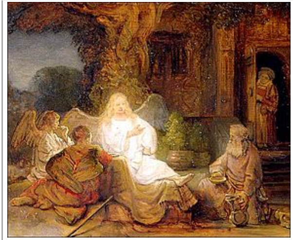
Abraham Serving the Three Angels, by Rembrandt, 1646