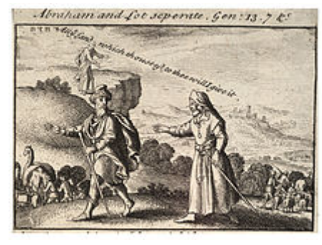
Abraham and Lot separate. Gen: 13.7 &.c, etching by Wenceslaus Hollar, 17th century

When they came back to the Bethel and Hai area, Abram's and Lot's sizable herds occupied the same pastures. This became a problem for the herdsmen who were assigned to each family's cattle. The conflicts between herdsmen had become so troublesome that Abram suggested that Lot choose a separate area, either on the left hand or on the right hand, that there be no conflict amongst brethren. Lot chose to go eastward to the plain of <u>Jordan</u> where the land was well watered everywhere as far as Zoar, and he dwelled in the cities of the plain toward <u>Sodom</u>. Abram went south to <u>Hebron</u> and settled in the plain of <u>Mamre</u>, where he built another altar to worship <u>God</u>.<sup>[6]</sup>